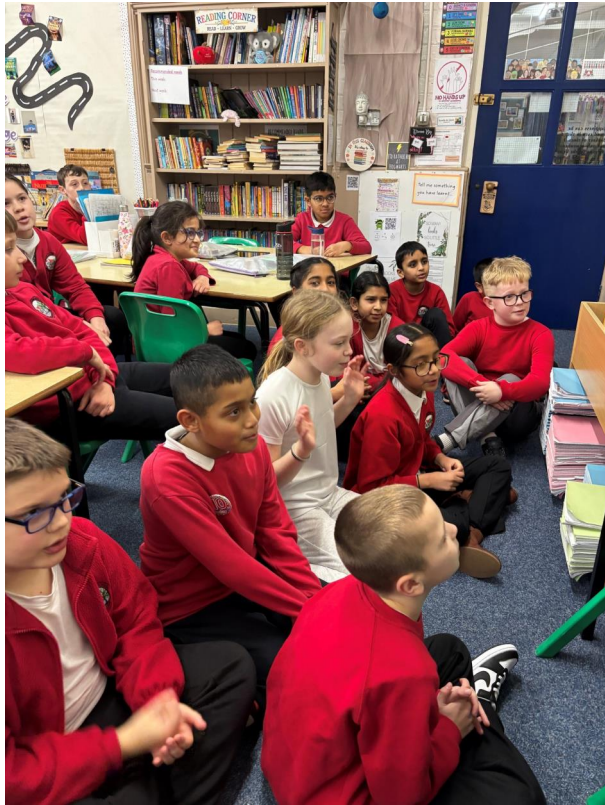
We had 15 Year 5 children working with Silhouette on composing a song for their part in the production of Midsummer Night's Dream.