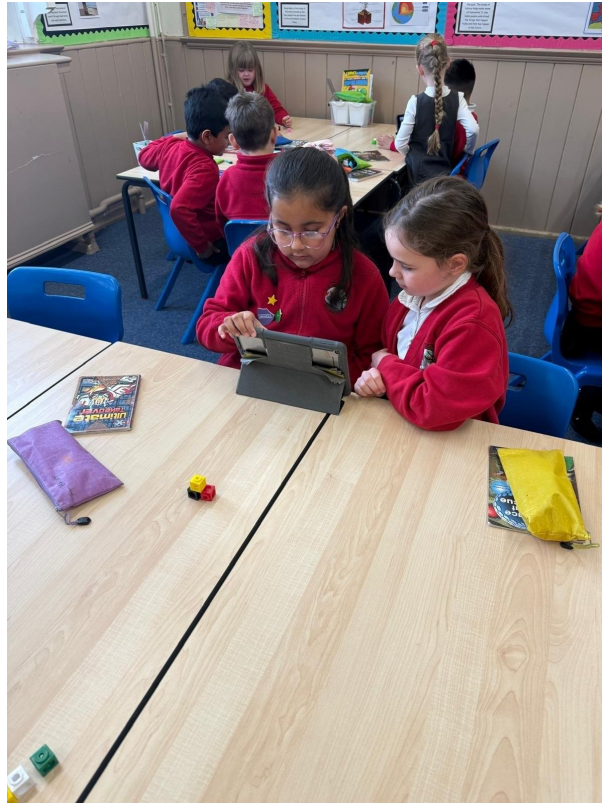
Year 3 loved their day at Flag Fen. Here are photos of some of the activities they did during their Roman Day.