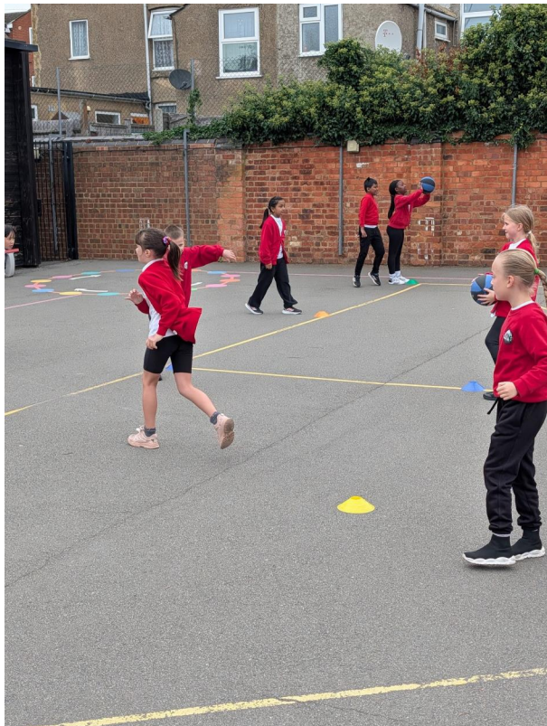
5LL had a wonderful time exploring our new school library.